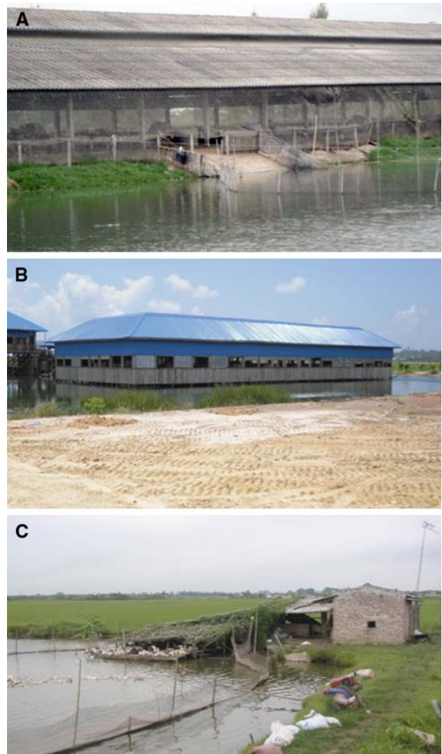
Figure 4. a: Duck house with exit onto fish pond, Thailand. b: Chicken house over fish pond, Cambodia. c: Ducks on fish pond, Vietnam.

The introduction of LPAI viruses into domestic poultry populations usually requires direct or indirect contact with infectious wild waterfowl or from wild waterfowl to domestic ducks (Alexander, 2006). Incursions of LPAI virus into domestic poultry have been reported over the past