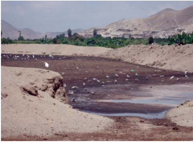
Figure 3. Seagulls and egrets at a hog waste lagoon near Lima, Peru.

of finfish in aquaculture (Little and Edwards, 2003), which results in the creation of artificial wetlands and thereby increases direct opportunities for contact with wild avians (Figure 4). This was noted as a risk factor for emergence and outbreaks of HPAI in Vietnam (Pfeiffer et al., 2007).